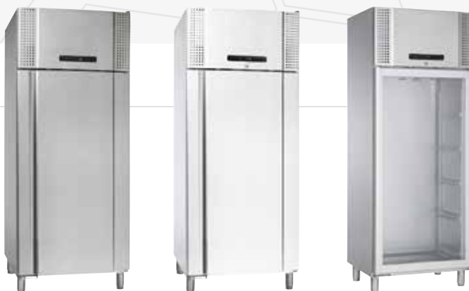
BioPlus 600/660W. Drawers and glass door are optional extras. (Glass door for ER only).

In terms of performance, these units are designed to provide the very best results even under exceptional conditions. The BioPlus utilises environmentally responsible HFC-free foam propellants and is available with HFC-free refrigerants.