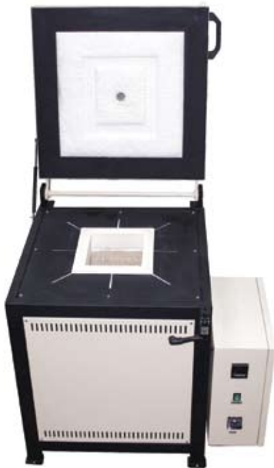
SNOL 10/900 LXC02