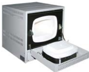
SNOL 8,2/1100 LZM01

High accuracy laboratory electric furnaces with fiber-insulated chambers, that are designed for hardening, loosening, normalising and other thermal processing up to a temperature of 1100 °C or 1300 °C. The furnaces include ceramic hearth plates. To eliminate gasses or smoke that are released during thermal processing, ventilation hole and an exhaust system may be additionally installed in the products. The furnaces are an excellent fit for scientific laboratories, educational institutions, medicine and industry.