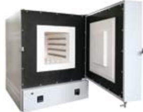
SNOL 40/1200 LSF01