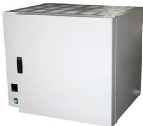
SNOL 67/350 LSN01