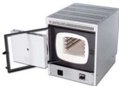
SNOL 6,7/1300 LSM01