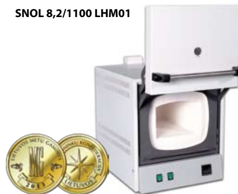
SNOL 8,2/1100 LHM01