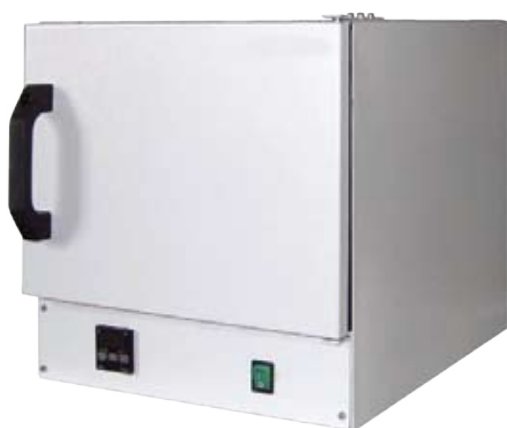
SNOL 24/200 LSP01

Economical low temperature electric ovens that are designed for the thermal processing of various materials and parts up to a temperature of 200 °C. The products can be used in scientific laboratories, educational institutions, medicine and industry. Optional forced air circulation (only in model SNOL 200/200) assures an even temperature distribution throughout the chamber and high quality thermal processing occurs quickly.