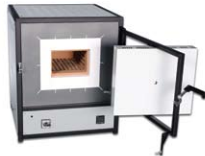
SNOL 7,2/1300 LSC01