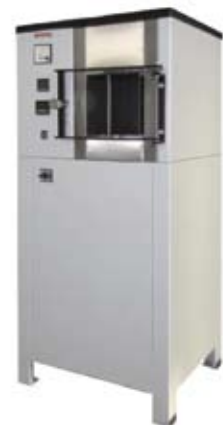
SNOL 8/1600 LSF01