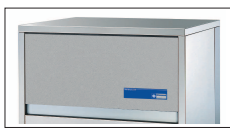
AISI 304 SS Scotch Brite finish