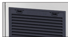
Removable and cleanable air filter